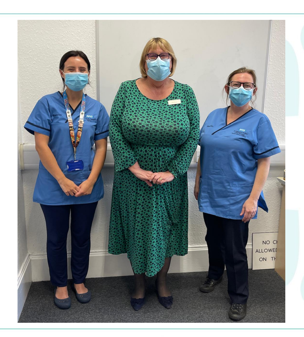
Igniting leaders, fuelling potential.