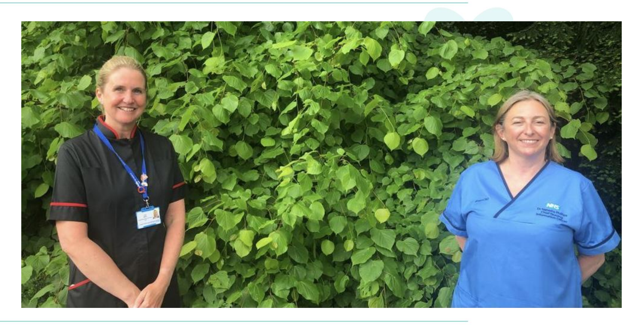
Igniting leaders, fuelling potential.